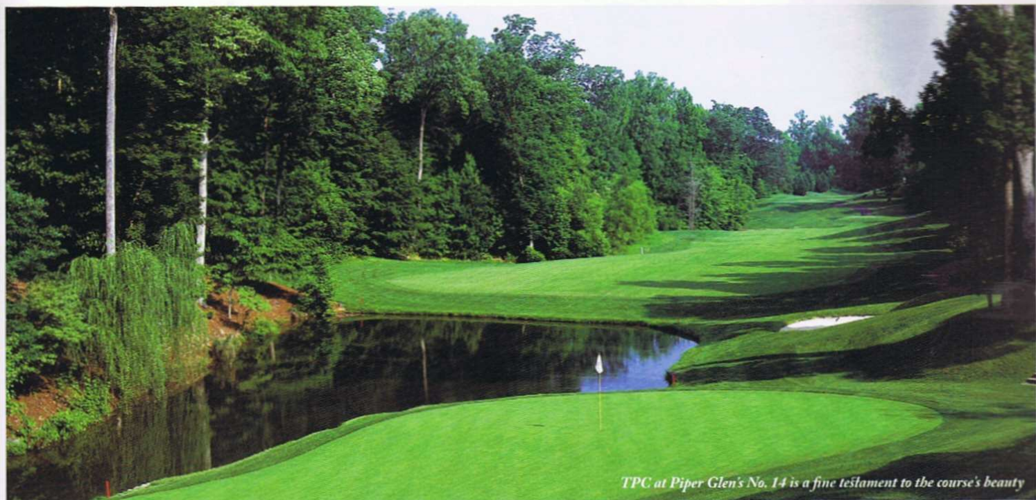
TPC at Piper Glen's No. 14 is a fine testament to the course's beauty