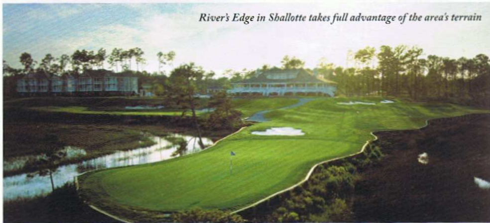
River's Edge in Shallotte takes full advantage of the area's terrain