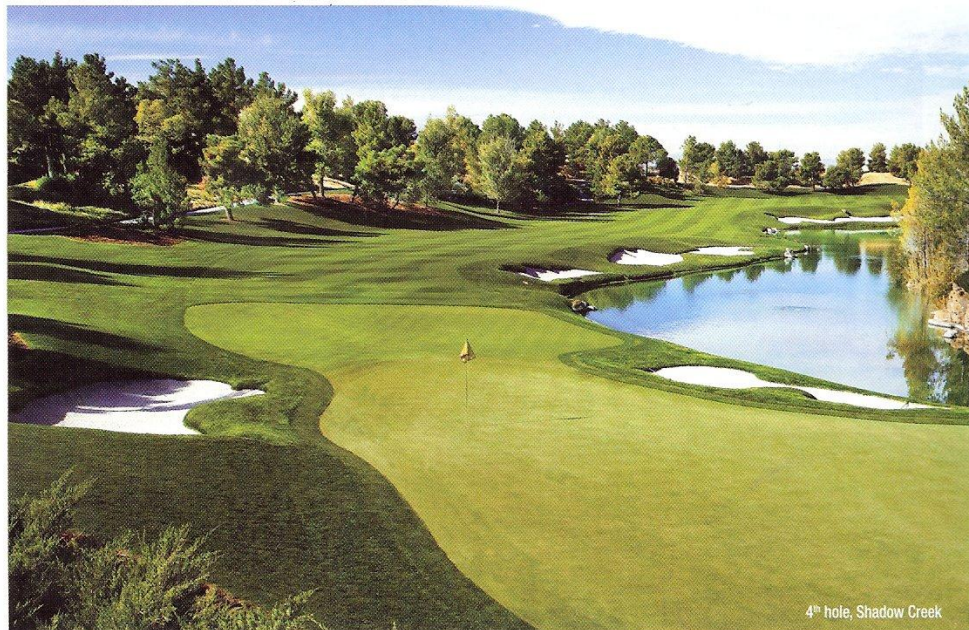
4 th hole, Shadow Creek

Guests at Las Vegas' premier resorts including Bellagio, ARIA Resort & Casino at CityCenter, The Mirage, MGM Grand and Mandalay Bay, among others, are granted privileged access to Shadow Creek.