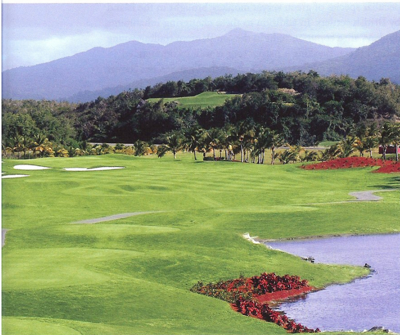
DORADO BEACH RESORT & CLUB (TOP) AND TRUMP INTERNATIONAL (ABOVE)

Rodriguez's native Caribbean island is as colorful and lively as its best-known golfer. Sun-drenched, pristine ocean beaches quickly give rise to fog-shrouded mountainous rainforests along parts of Puerto Rico's coast. Exotic iguanas freely roam across its golf courses like prehistoric forecaddies. The imposing colonial forts of Old San Juan meld into the nearby Ben & Jerry's commercial hipness of the vibrant new sections of the city.