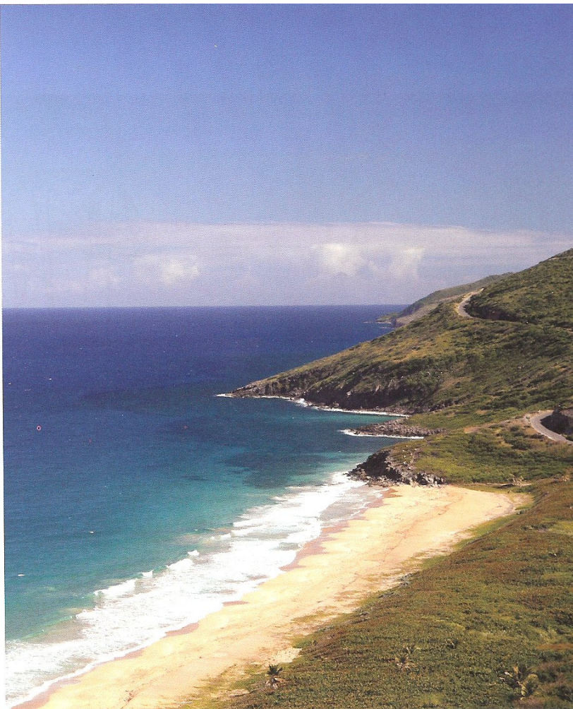
NEVIS IS HOME TO A RAINFOREST AS WELL AS SANDY BEACHES

Puerto Rico's marketing slogan is "Explore Beyond The Shore." That is sound advice for all that the island has to offer. Just make sure that plenty of golf along some of its stunning Atlantic and Caribbean coastal courses is also an integral part of the itinerary.